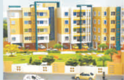
Pearl Heights, Rourkela, Odisha