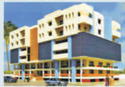
Panchawati Tower, Barbil, Odisha