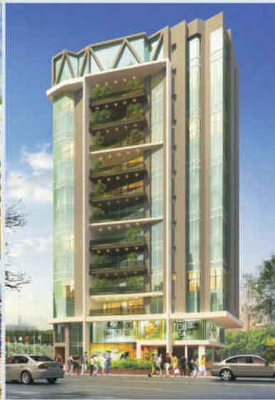
Gurukul Grandeur, Hazra Road, Kolkata