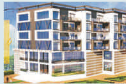
Sahej Success, Rourkela, Odisha