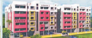
Panchawati Residency, Barbil, Odisha