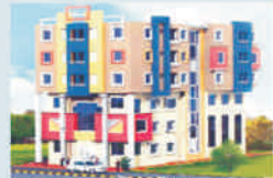
Joda Tower, Joda, Odisha